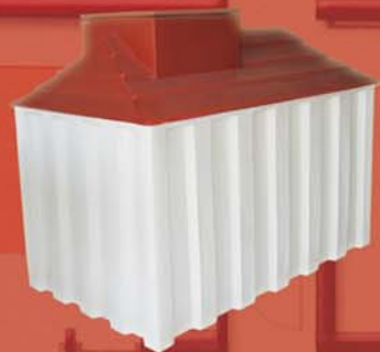
Water Storage Tank