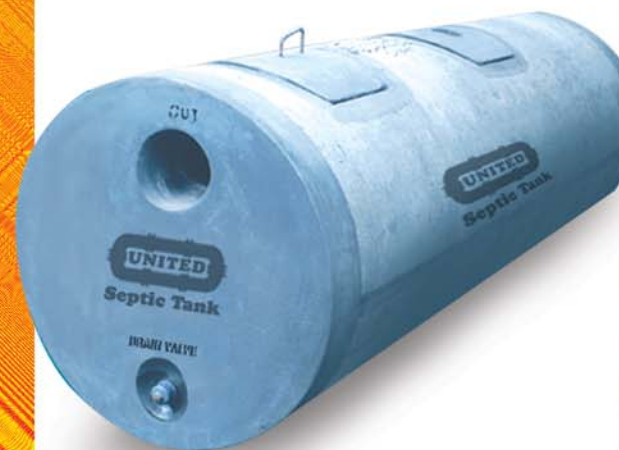
R.C.C. Septic Tank