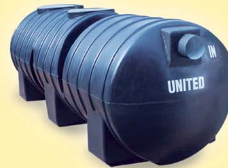
Polyethylene Septic Tank