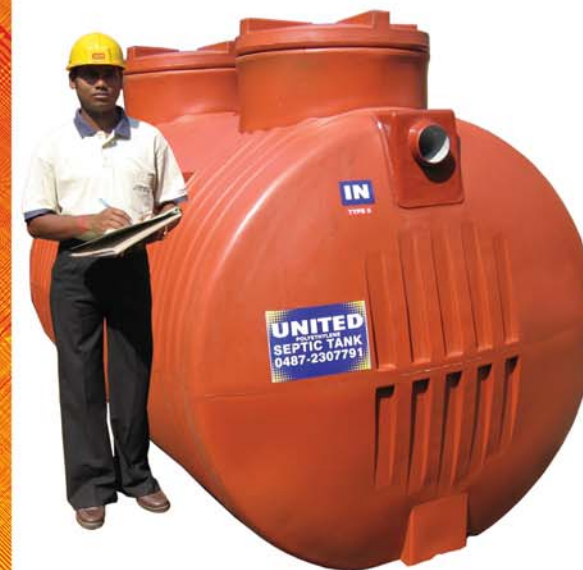
Polyethylene Septic Tank