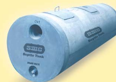
R.C.C. Septic Tank

In view of constant research and development, the specifications are subject to change without prior notice.