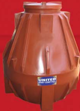
Vertical Septic Tank

The sump tank is also designed to be used as vertical Septic tank, with additional attachments inside. The tank is coloured in Terracotta colour to match the international colour code for sewage system.